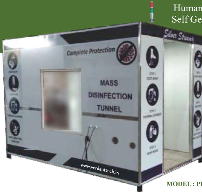
MODEL : PREMIUM